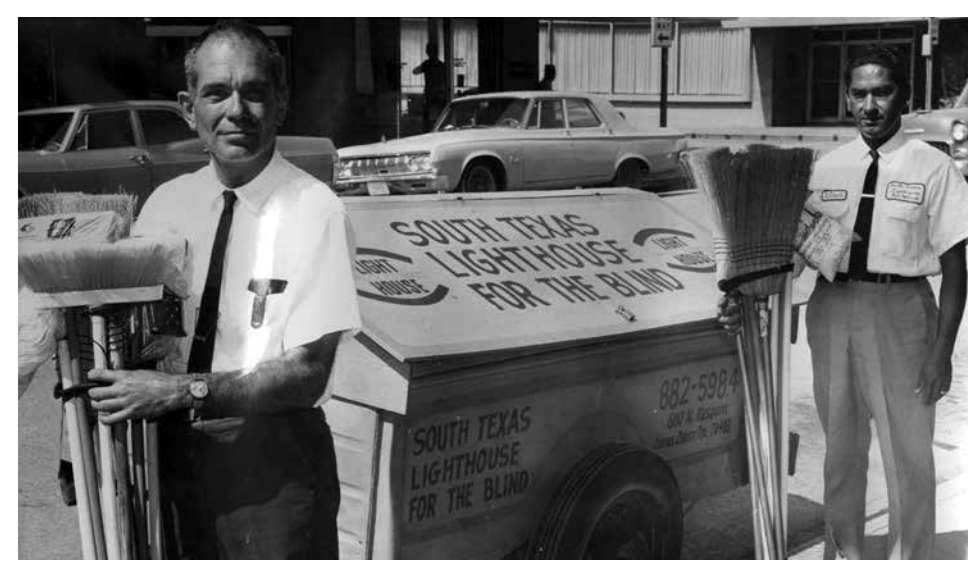
In the 1960s, mops and brooms produced by the South Texas Lighthouse for the Blind were sold door-to-door in Corpus Christi.

South Texas Lighthouse operates two AbilityOne Base Supply Centers, known as 1 Store Solutions, in Texas on Naval Air Station Corpus Christi and Naval Air Station Kingsville, as well as the Corpus Christi Army Depot