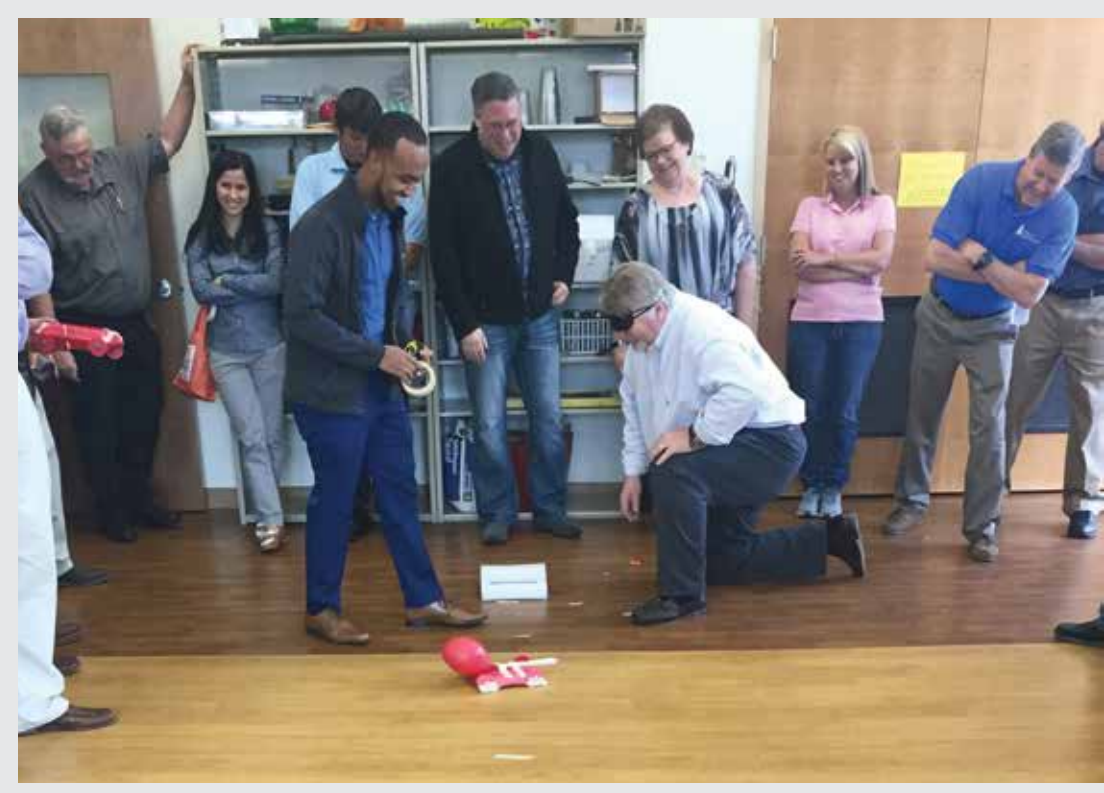
Participants in the Rehab Forum tested a balloon racing car designed during a group exercise simulating blindness and other disabilities. The group exercise encouraged networking, teamwork, and employee perspectives.

IFB Solutions in Winston Salem, North Carolina, hosted 57 participants from 19 different NIB associated agencies at the Rehab Engineering Forum and Product Development Plan Training April 25-27. During the forum, agencies shared success stories of project implementation, job conversions, and process improvements made to meet cost targets. In multiple brainstorming sessions participants shared concerns and potential solutions for addressing challenges encountered on specific projects in progress, and common issues such as attendance and increasing efficiency.